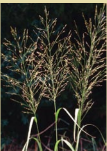
Switch grass ( Panicum virgatum )