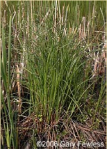
Tussock sedge ( Carex stricta )