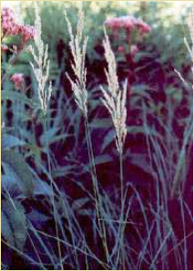
Blue joint grass ( Calamagrostis canadensis )