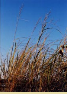
Prairie cord grass ( Spartina pectinata )