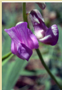
Purple vetch ( Vicia americana )