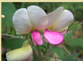
Goat's-rue ( Tephrosia virginiana )