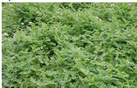
Dense growth of crown vetch.

Mowing can eventually control crown vetch if it is repeated several times a year for several years. Prescribed burning may also be effective in late spring but should also be repeated for several years. Always read and follow pesticide label directions.