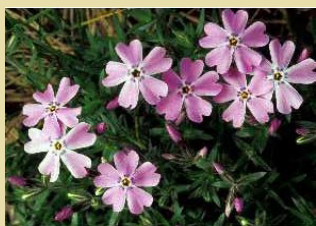
Creeping Phlox ( Phlox subulata )