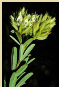
Roundheaded bushclover ( Lespedeza capitata )