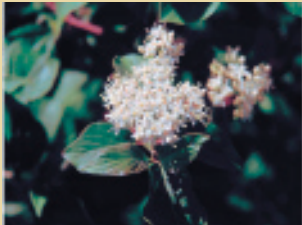
Dogwoods ( Cornus sericea , C. amomum , and C. racemosa )