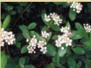
Chokeberry ( Aronia melanocarpa )