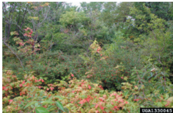
Dense thicket of Asian bush honeysuckle.

stands of Asian bush honeysuckles are probably best managed by cutting the stems to ground level and painting or spraying the stumps with a 20-30% solution of glyphosate or 8% solution of triclopyr (e.g. Ortho Brush B-Gon concentrate). Always read and follow pesticide label directions.