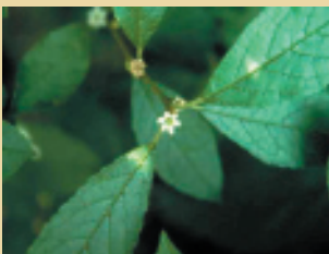
Winterberry ( Ilex verticillata )