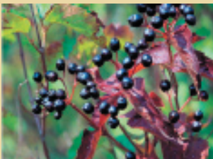
Northern arrowwood ( Viburnum dentatum )