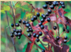
Northern arrowwood ( Viburnum dentatum )