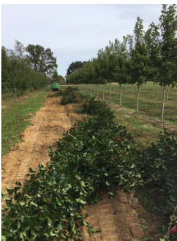
Figure 1. Voluntary Callery pear removal by an Indiana nursery (Photo: R. Haggard, Executive Director, Indiana Nursery and Landscape Association).

State conservation departments all over the United States are warning homeowners against planting Callery pear, and the sale and distribution of all cultivars of this tree has already been made illegal in Ohio ( https://www.dispatch.com/news/20180107/38-species-of-invasive-plants-now-illegal-to-sell-in-ohio ). A Terrestrial Plant Rule prohibiting the sale of ~40 damaging invasive plants is making its way through Indiana's Natural Resource Commission rule-making process ( http://www.in.gov/legislative/iac/20181121-IR-312180316PRA.xml.pdf ). Given its highly invasive status in Indiana, there is a strong push to place Callery pear on the list of prohibited species. In anticipation of this, nurseries in Indiana are voluntarily beginning to phase out their stock of Callery pear (Figure 1).